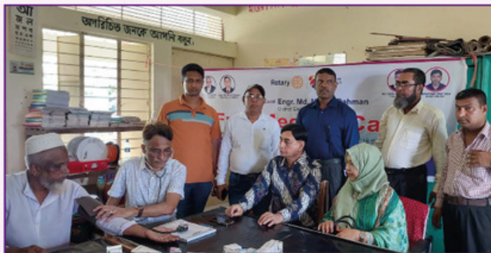
Medical Health Camp Project of RC Begumganj