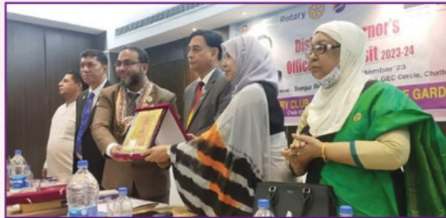
DG Visit of RC Chittagong Rose Garden