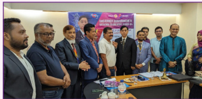
DG Visit of RC Chittagong City