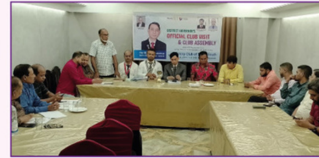
DG Visit of RC Sylhet South