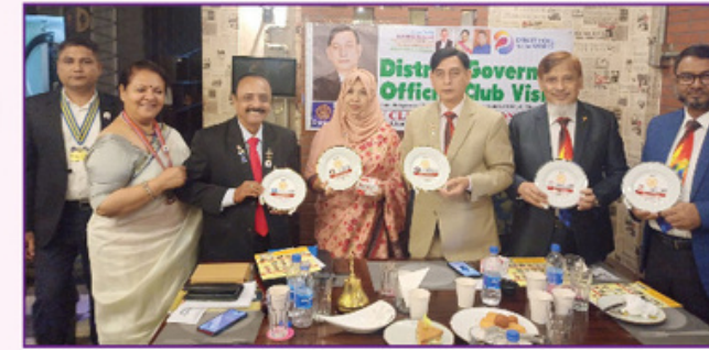
DG Visit of RC Chittagong East