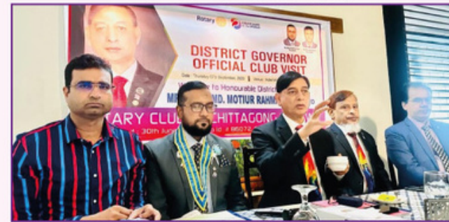
DG Visit of RC Chittagong Uptown