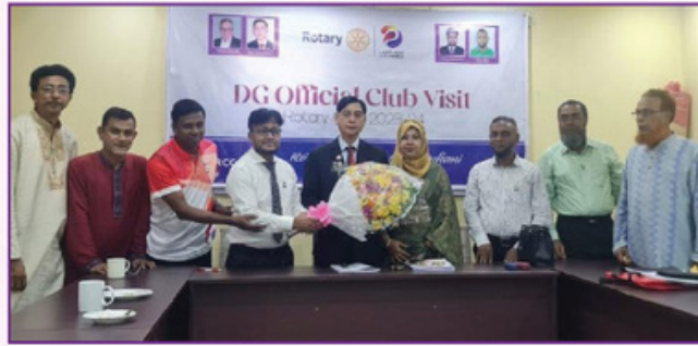
DG Visit of RC Chowmuhani