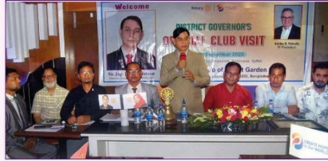
DG Visit of RC Sylhet Garden City