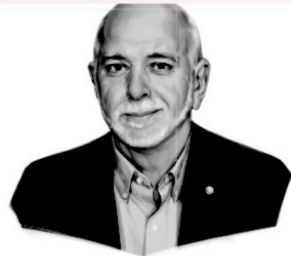
TRUSTEE CHAIR'S MESSAGE