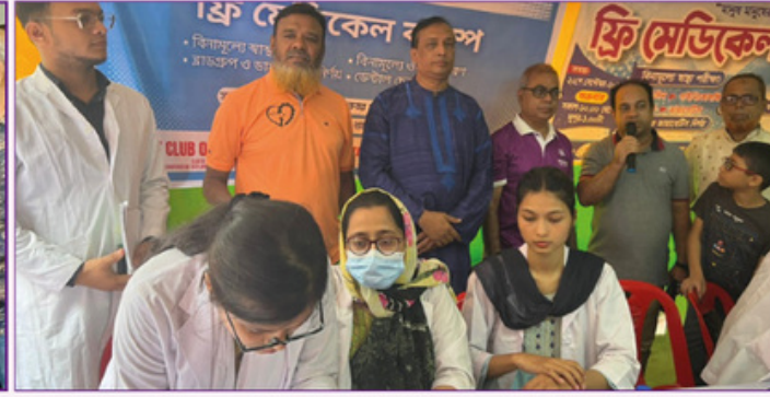
Free Medical Camp and Medicine Distribution of RC Greater Chittagong