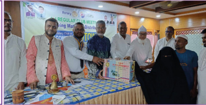
Sewing Machine Distribution of RC Comilla Midtown