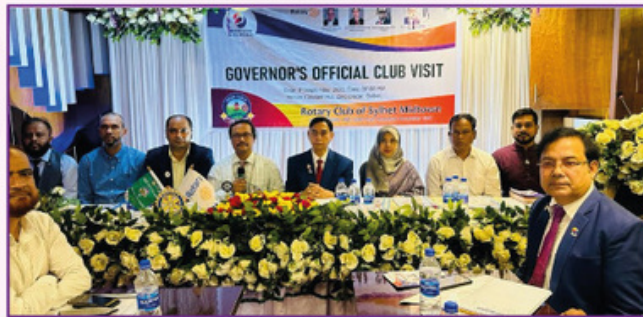
DG Visit of RC Sylhet Midtown