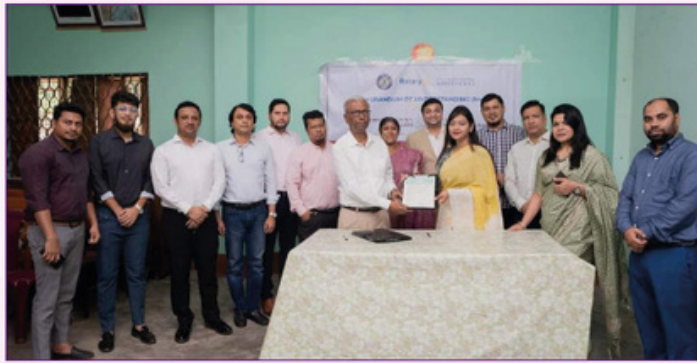
Mou Signing Ceremony of RC Chittagong Aristocrat with Probottak School