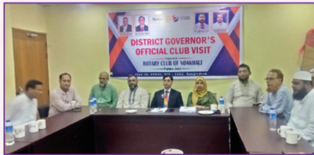
DG Visit of RC Noakhali