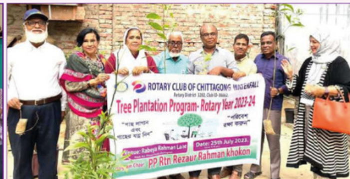
Tree Plantation Project of RC Chittagong Waterfall