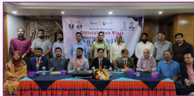
DG Visit of RC Anderkillah