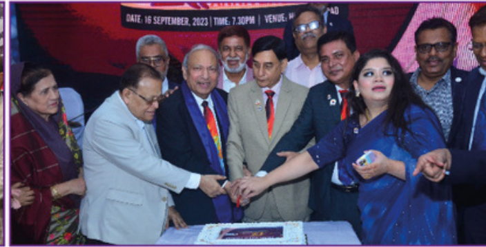
Charter Anniversary Celebration of RC Agrabad