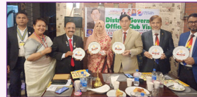
DG Visit of RC Chittagong East