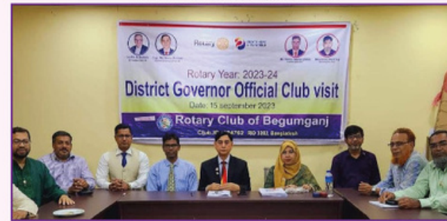
DG Visit of RC Begumgonj