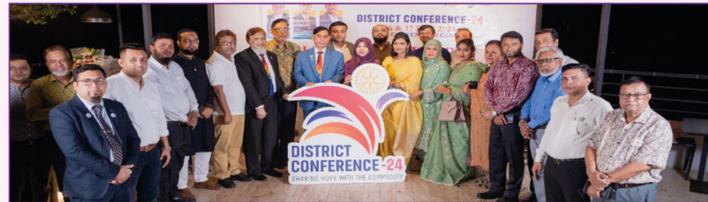
District Conference 24 Logo Unveiling Program