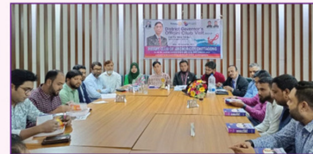
DG Visit of RC Anchor City Chittagong