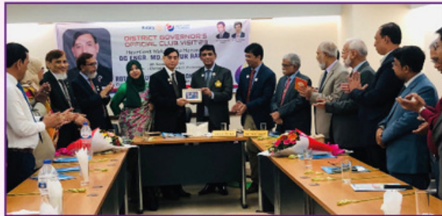
DG Visit of RC Chittagong Downtown