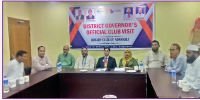
DG Visit of RC Noakhali