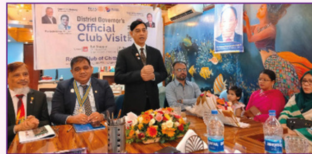
DG Visit of RC Chittagong Pearl