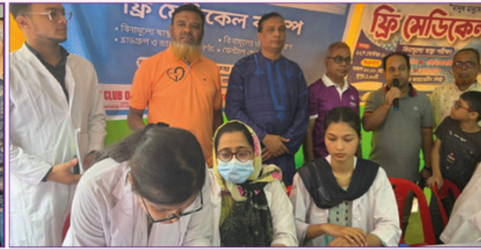
Free Medical Camp and Medicine Distribution of RC Greater Chittagong