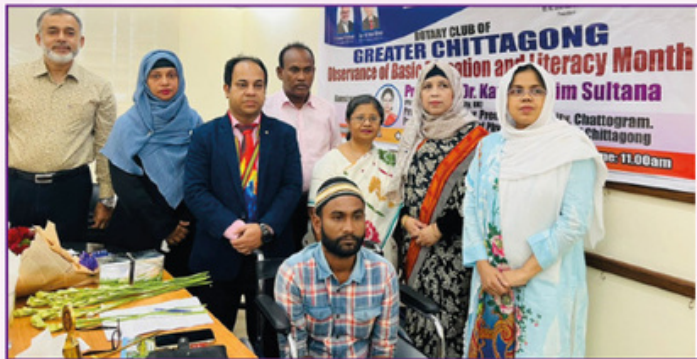
Wheelchair Distribution to Underprivileged People of RC Greater Chittagong