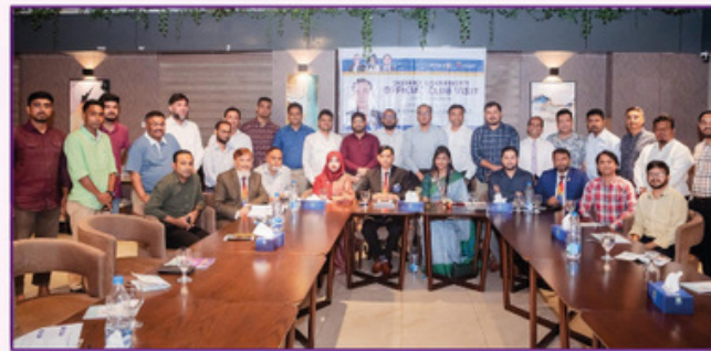
DG Visit of RC Chittagong Aristocrat