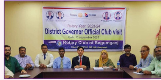
DG Visit of RC Begumgonj