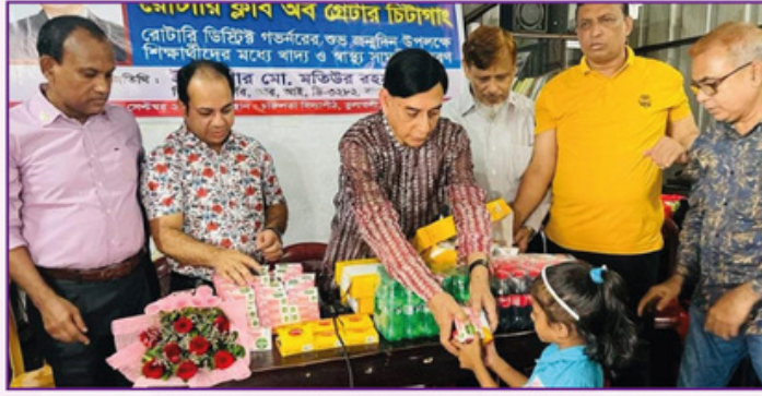
Food and Health Materials Distribution of RC Greater Chittagong