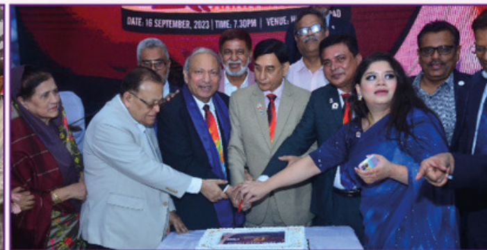
Charter Anniversary Celebration of RC Agrabad