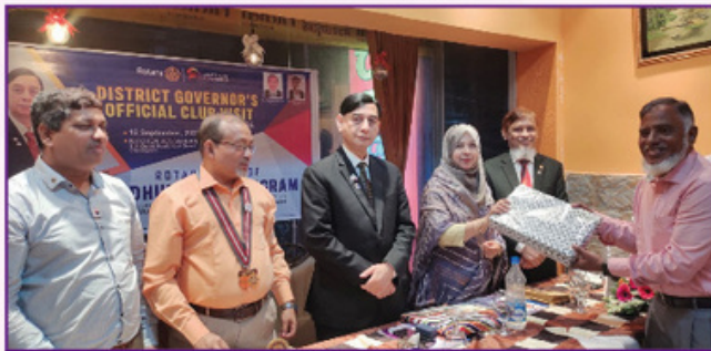
DG Visit of RC Adhunik Chattogram