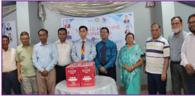
DG Visit of RC Nobiganj