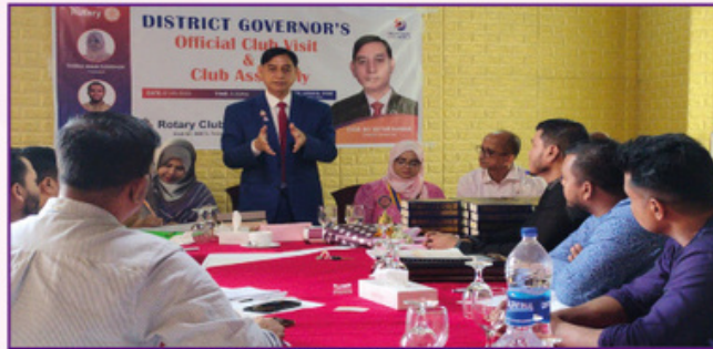
DG Visit of RC Chittagong Imperial