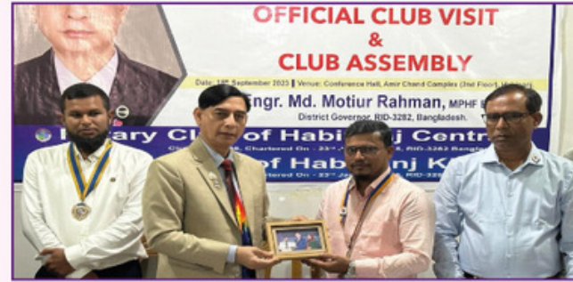
DG Visit of RC Habiganj Central