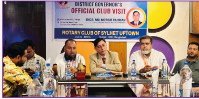
DG Visit of RC Sylhet Uptown