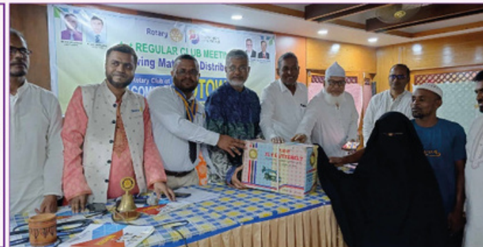
Sewing Machine Distribution of RC Comilla Midtown