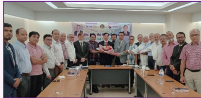
DG Visit of RC Islamabad