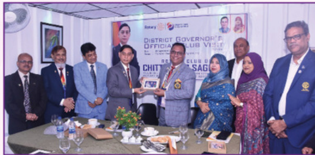
DG Visit of RC Chittagong Sagorika