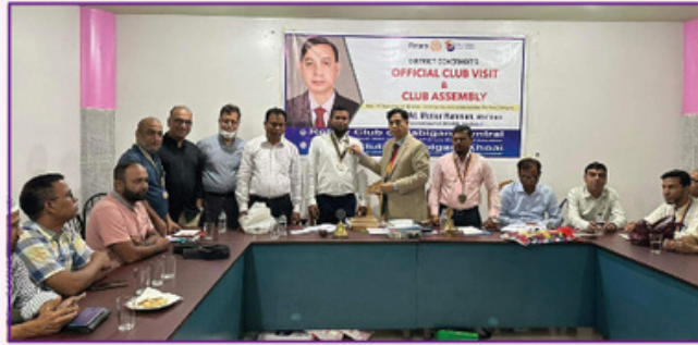
DG Visit of RC Habiganj Khaoai