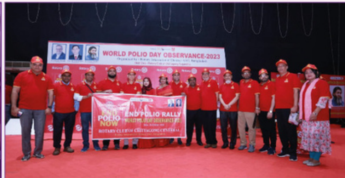
World Polio Day Observance 2023