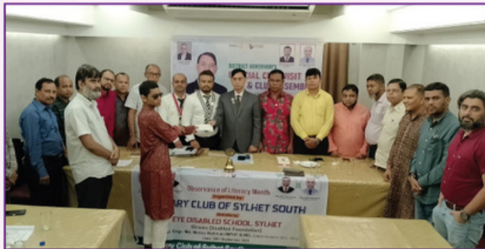
Rotary Literacy Month Celebration & Help for Eye Disabled Student of RC Sylhet South