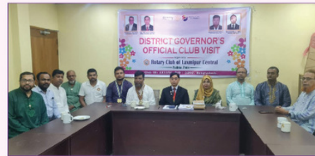
DG Visit of RC Laxmipur Central