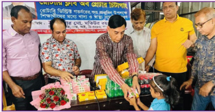
Food and Health Materials Distribution of RC Greater Chittagong