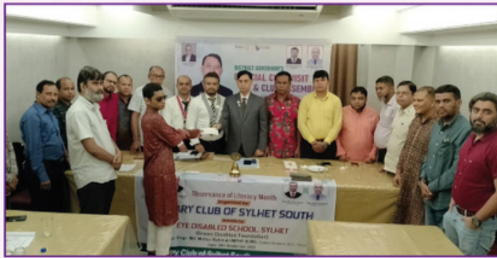
Rotary Literacy Month Celebration & Help for Eye Disabled Student of RC Sylhet South