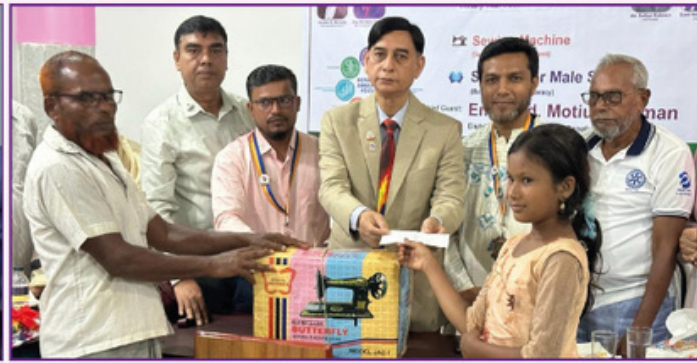
Sewing Machine Distribution Project of RC Habiganj Central