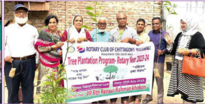
Tree Plantation Project of RC Chittagong Waterfall