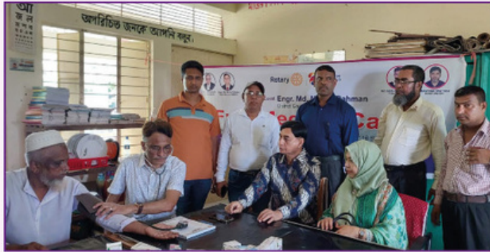
Medical Health Camp Project of RC Begumganj