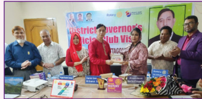
DG Visit of RC Chattogram Smile