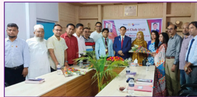
DG Visit of RC Sreemangal