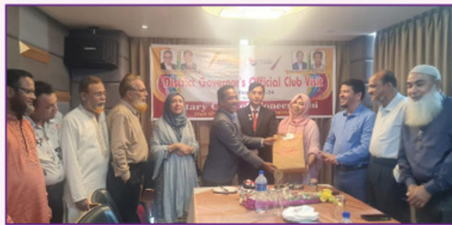
DG Visit of RC Pioneer Feni