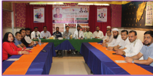
DG Visit of RC Sylhet Pioneer