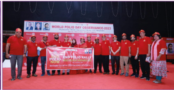
World Polio Day Observance 2023