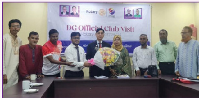
DG Visit of RC Chowmuhani