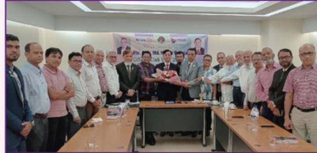
DG Visit of RC Islamabad