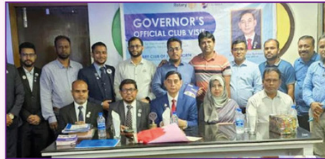
DG Visit of RC Sylhet North