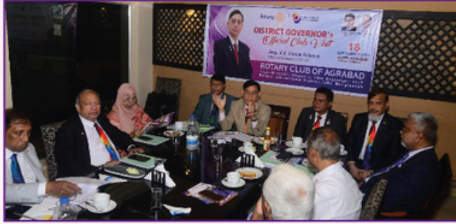
DG Visit of RC Agrabad