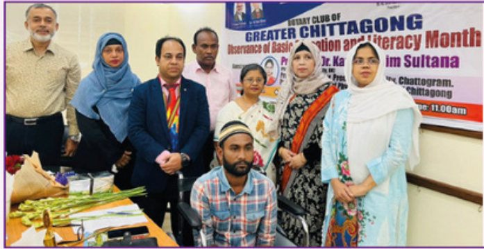
Wheelchair Distribution to Underprivileged People of RC Greater Chittagong