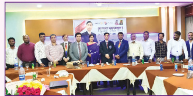
DG Visit of RC Ancient Chittagong