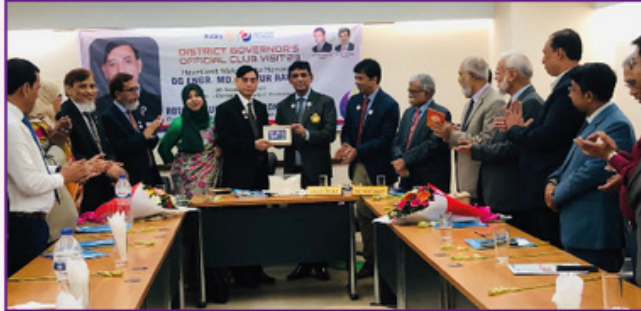
DG Visit of RC Chittagong Downtown