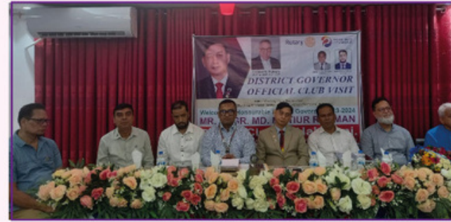
DG Visit of RC Habiganj