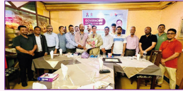
DG Visit of RC Sylhet Vally